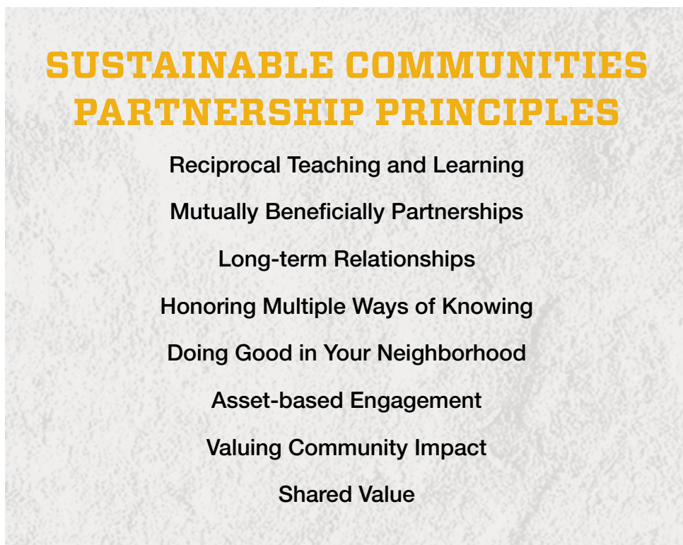
Principles of Engaging with Community Partners

Writing and communication courses typically engage community through “service learning” that is conceived of as either “reflective” or “client-based” (or a mixture of the two). The Writing and Communication Program Handbook offers an excellent definition of these models: http://devlab.lmc.gatech.edu/wiki/index.php/Service_Learning .