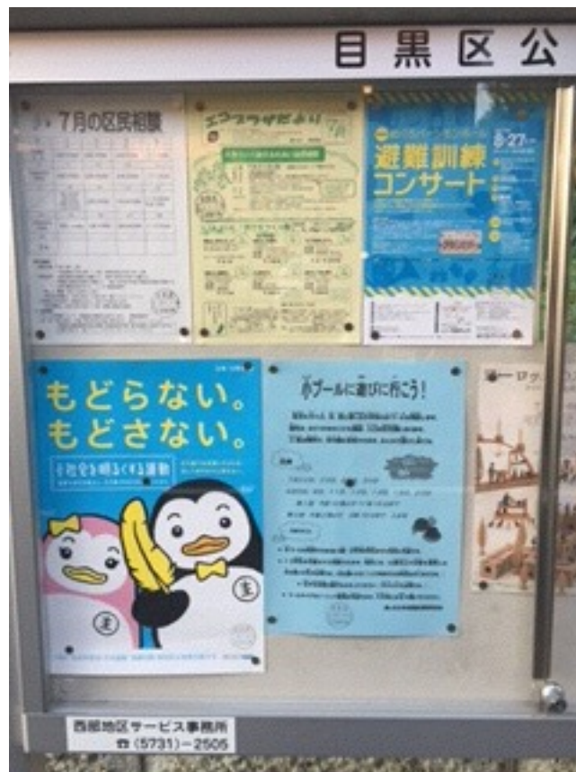
6). A board showing several events or notices for Meguro, Tokyo, where a few of my friends and I visited to look for local assets. One of the notices tell of an upcoming concert organised by the local fire department orchestra. After the terrorist attack at Ariana Grande's concert in Manchester, there seems to be more concerts like these, where the audience and the performers pretend as though there is an attack or a natural disaster during the concert.