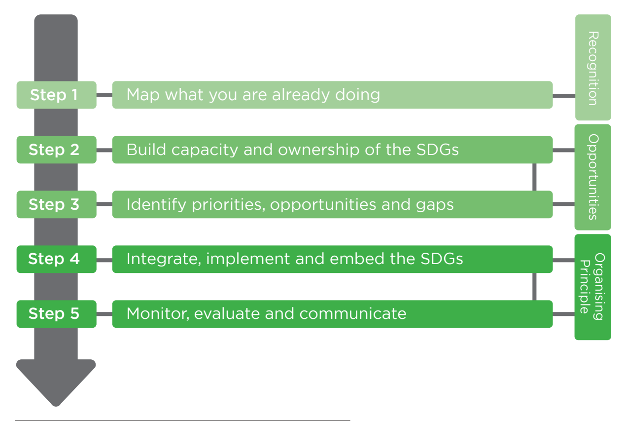
Figure 3: Overview of the step-by-step SDG integration process.

This Section provides guidance on Steps universities can take to start and to deepen their engagement with the SDGs. These Steps, which have been adapted from other guides<sup>i</sup>, are summarised in Figure 3 and are described in more detail below.